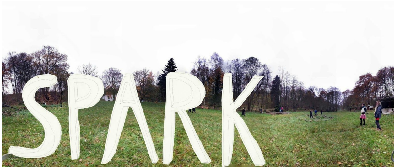
Collage by Leo Sauermann